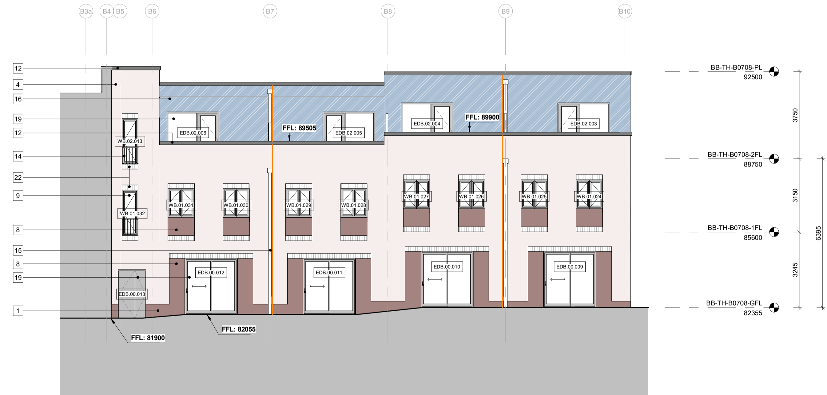
2 West Elevation (B)