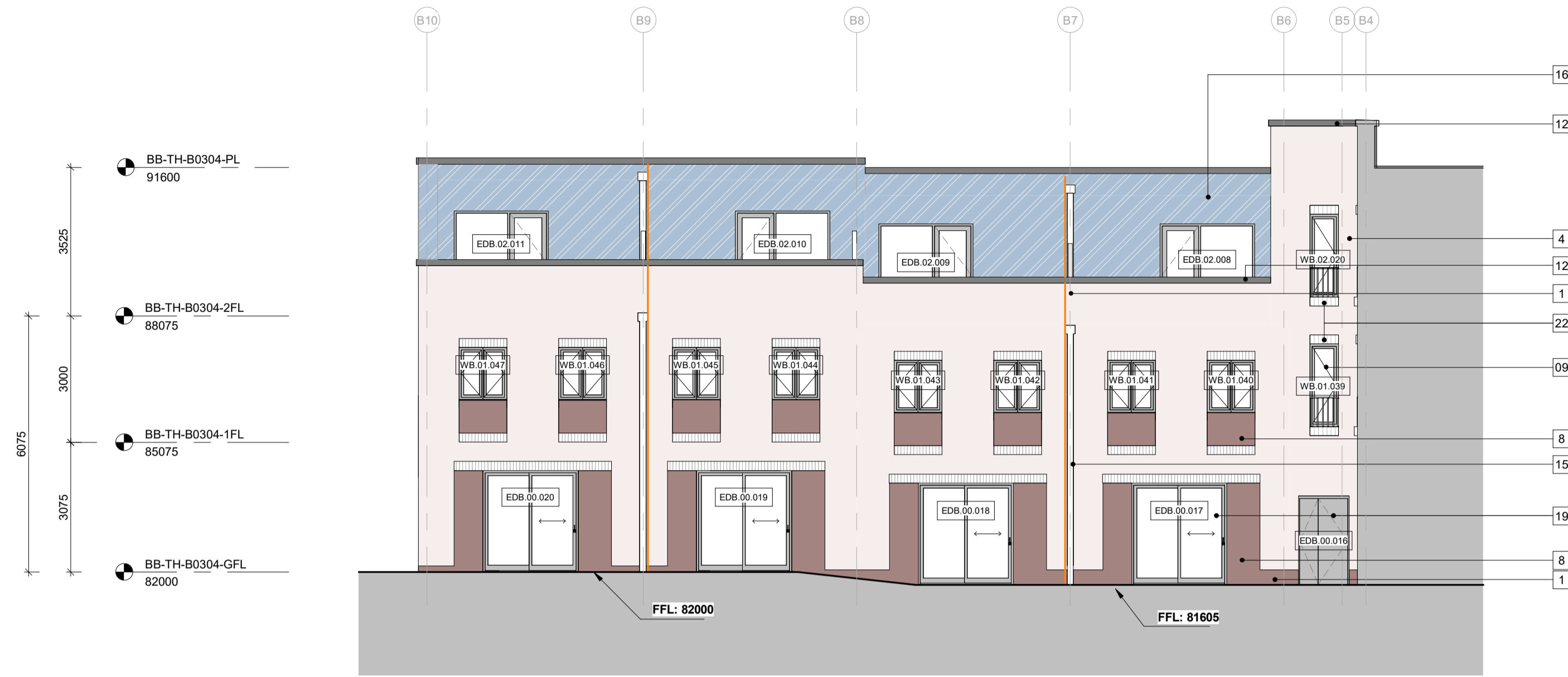
1 East Elevation (B)