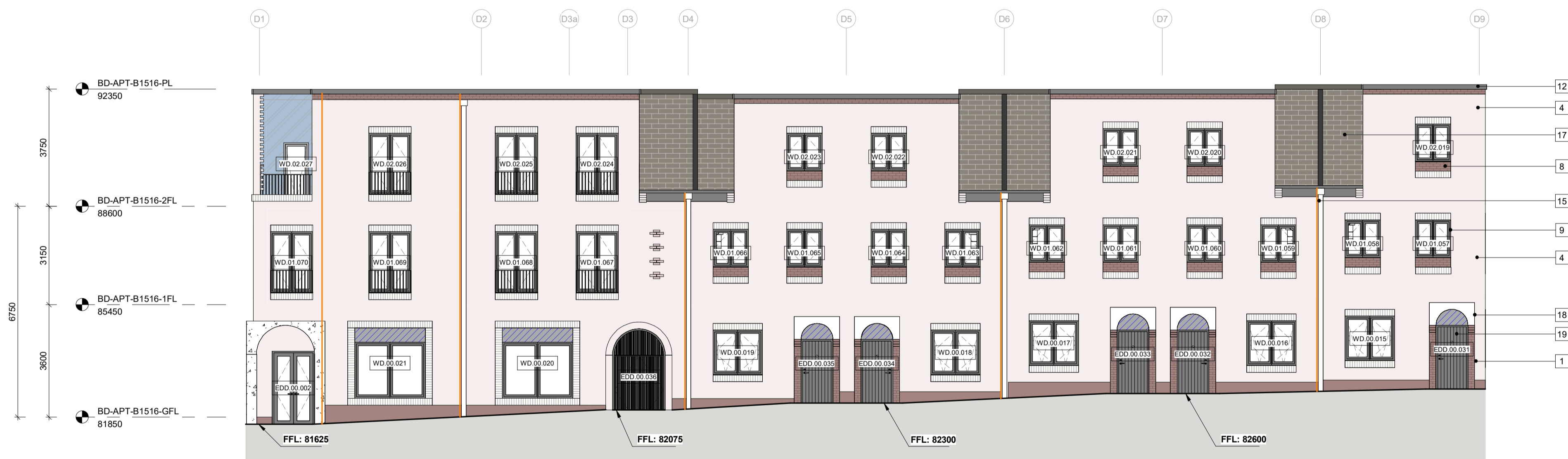
2 West Elevation 1 : 100