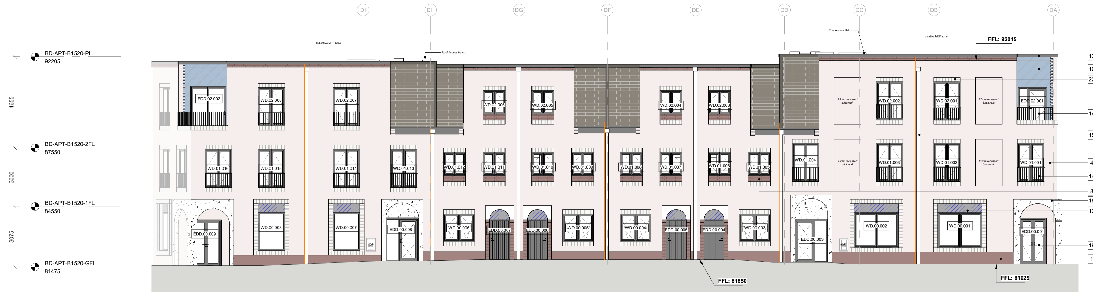
1 North Elevation 1 : 100