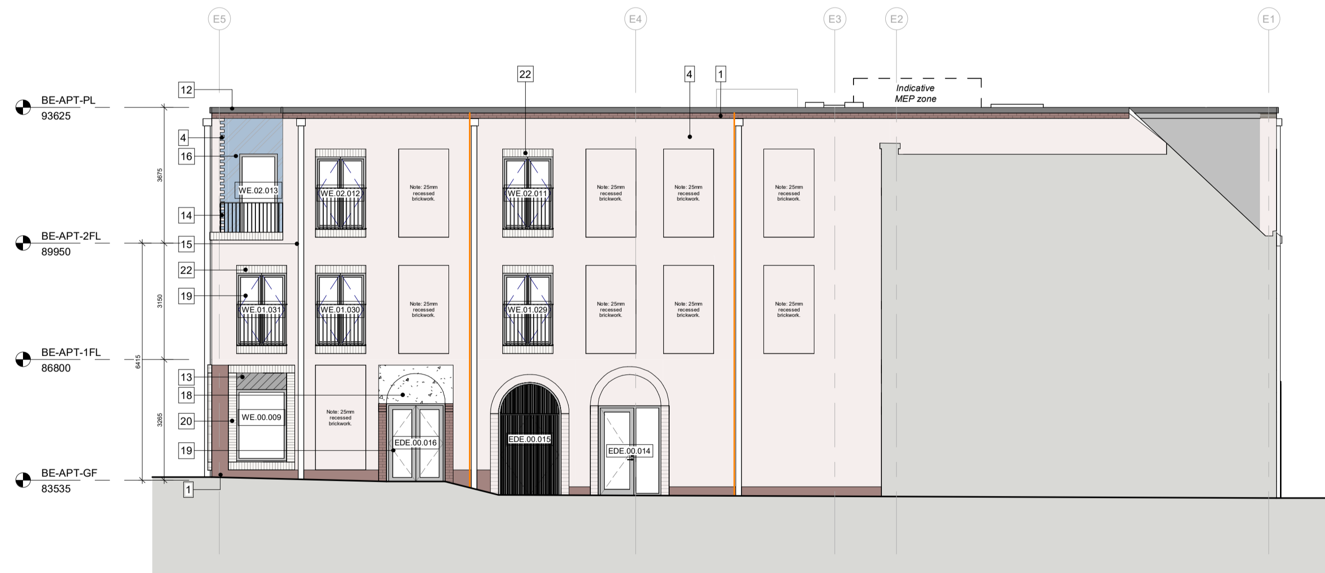
2 East Elevation - B 1 : 100