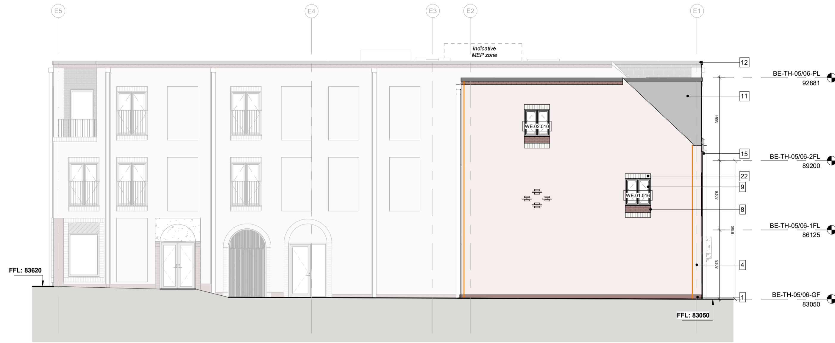
1 East Elevation - A 1 : 100