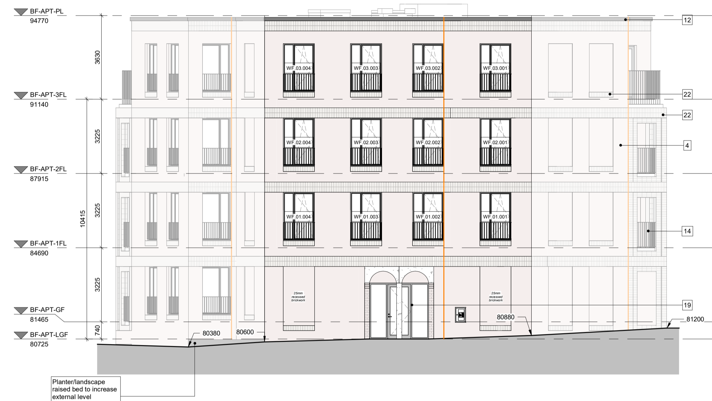
2 North East Elevation 1 : 100