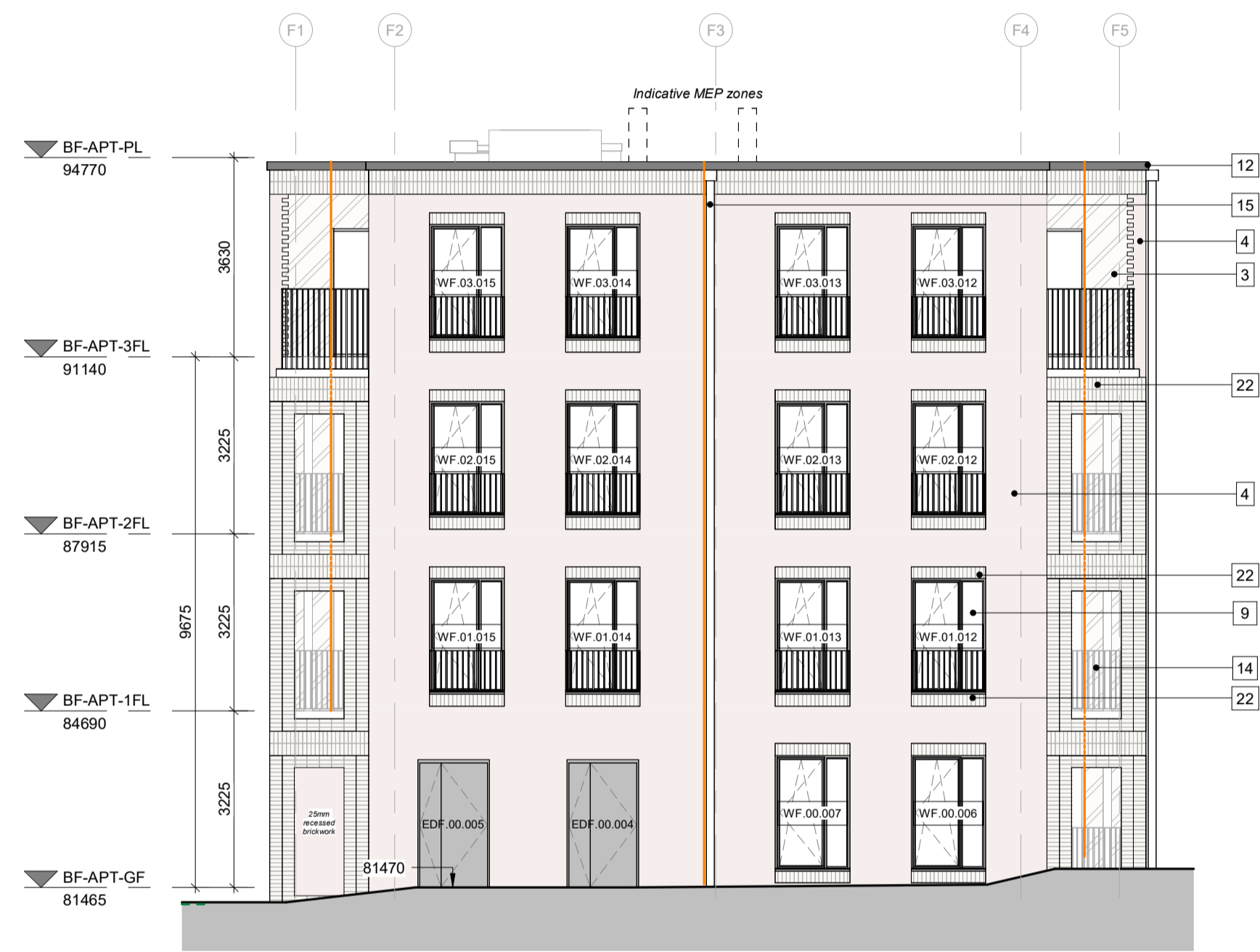
1 West Elevation 1 : 100