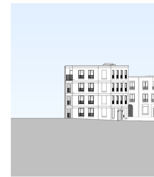
5 Street Scene - St Georges Way 1 : 500