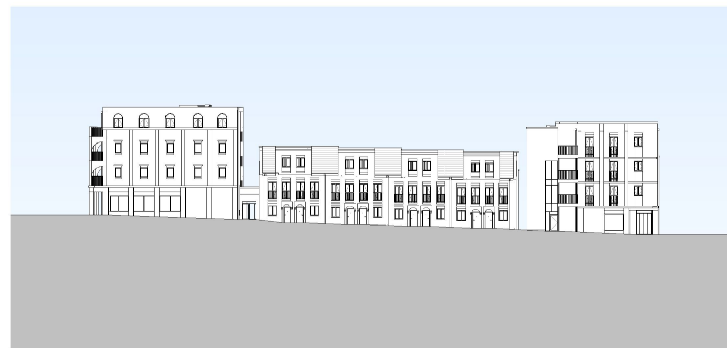
3 Street Scene - Radcliffe Street West 1 : 500