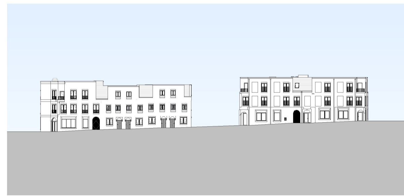
4 Street Scene - Radcliffe Street East 1 : 500