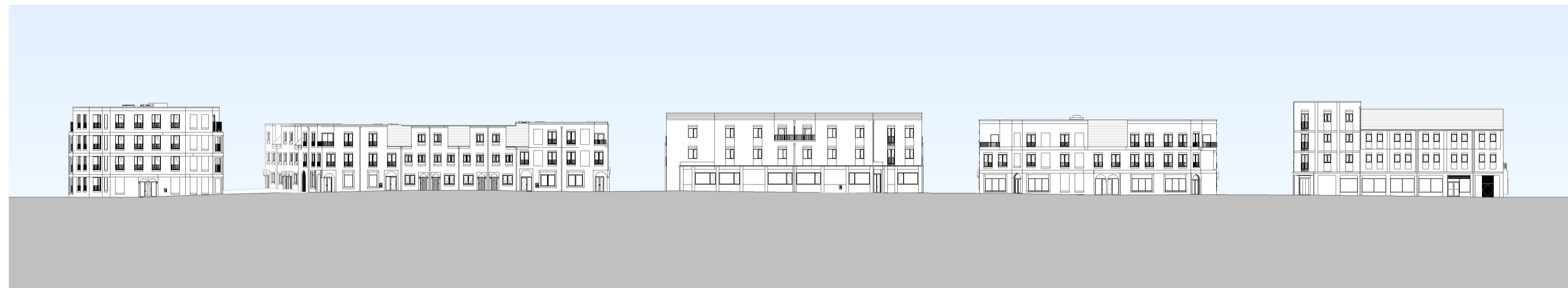
2 Street Scene - Church Street 1 : 500