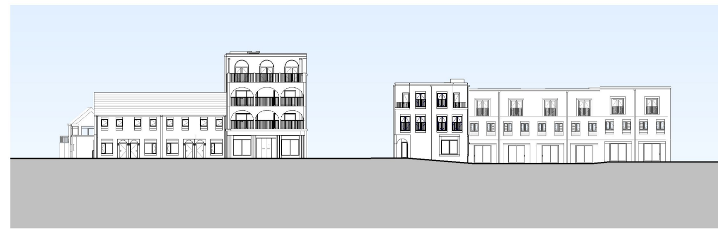
1 Street Scene - Buckingham Street 1 : 500